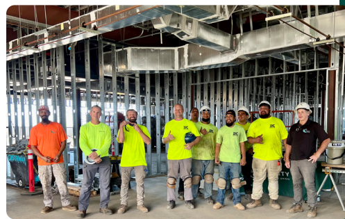
Mahalo to the construction works and contractors who have made our new building possible!