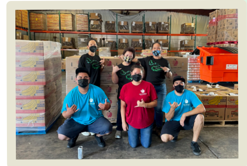
Since 2017, we've helped the Maui Food Bank in various ways including food drives, monetary donations and volunteering regularly.

If you'd like to nominate a nonprofit organization for support, please email hello@mauicountyfcu.org . Qualifying nonprofits must be a 501(c)3 designated organization located in the County of Maui, must be nominated by a Maui County FCU member, and cannot have been a nonprofit selected within the previous 24 months.