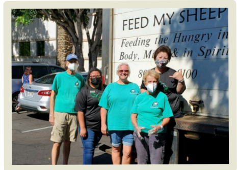
Since 2021, we've volunteered with Feed My Sheep to distribute food to those in need in central Maui and Lahaina.