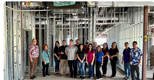
Standing in what will be a future contact center.