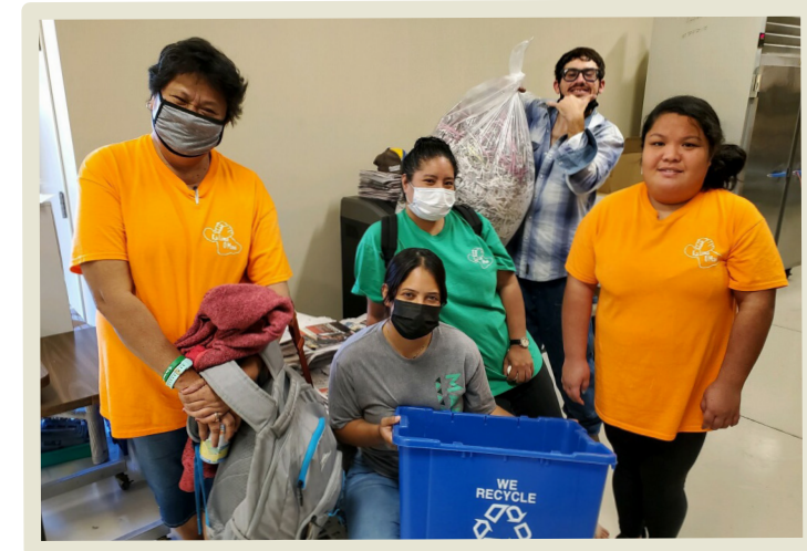
Since 2021, we've been supporting Ka Lima O Maui by donating newspaper for shredding by their Medicaid waiver participants. Ka Lima O Maui provides job training and jobs for individuals with disabilities.

Malama Kākou Maui, our community giving program, will support one local nonprofit throughout one month of each quarter (in February, May, August and November). Throughout the month we will be collecting donations online and at all three of our branches in support of a nonprofit organization. The impact of funds raised will be even greater with Maui County FCU matching collected donations up to $2,500!