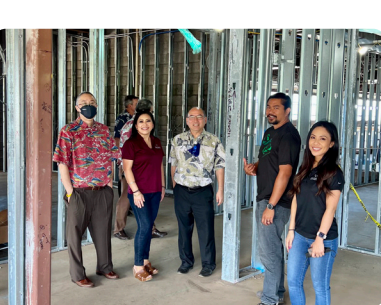
Members of our leadership team taking a look at the progress.