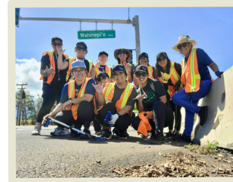
The Lending team filled their trash bags with opala lodged between the oceanside rocks.