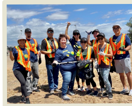
The Accounting, Admin, Compliance, HR, IT and Marketing crew were all smiles.

In observance of Juneteenth, now a federal holiday, we closed our branches and offices for company-wide training and to give back to our community. We spent the afternoon picking up trash around the Kahului Boat Harbor.