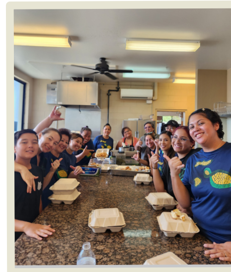
Employees continued helping seniors by preparing and delivering meals to Hale Mahaolu residents in support of the Binhi At Ani Bayanihan Elderly Feeding Program.

The Credit Unions of Maui planned to hold its 8th annual Golf Tournament to benefit Hospice Maui on August 12, 2023. In consideration of recent events, the Tournament was canceled, and in partnership with Hospice Maui, it was decided that the funds raised would have the greatest impact supporting the Credit Unions of Maui Wildfire Relief Fund, which has been providing assistance to those impacted by the fires. Mahalo to the generous sponsors, donors, and golfers who helped raise $38,000.