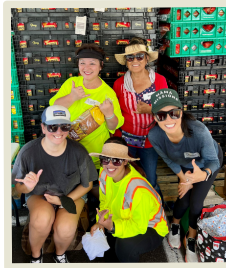
Employees spent their Statehood Day volunteering at the Lahaina Gateway Distribution Hub, ensuring that Lahaina residents received much needed food, water and supplies.