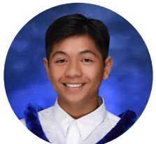
Kahanu Vista Grand Canyon University