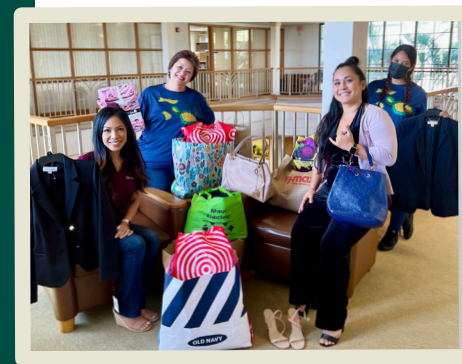
Employees collected and donated 10 bags full of clothing to Women Helping Women.

In addition, employees lent a hand at the Maui Food Bank and packed 288 emergency bags of food to help prevent food insecurity and Maui County FCU sponsored the 1st Annual Maui Nui Scouting Golf Tournament in support of the Boy Scouts.