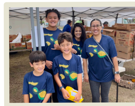
Employees and members distributed food to those in need with Feed My Sheep on April 23, 2022.