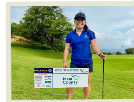
Golfing at the 1st Annual Maui Nui Scouting Tournament on April 30, 2022.