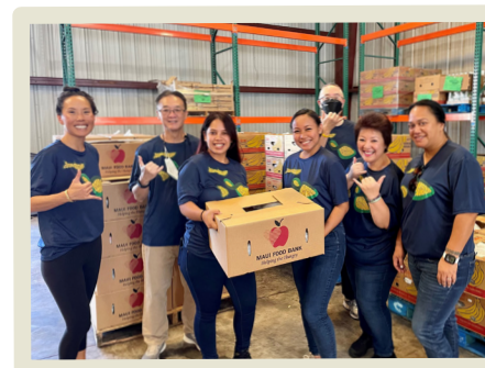
Employees packed emergency food bags at the Maui Food Bank on May 11, 2022.