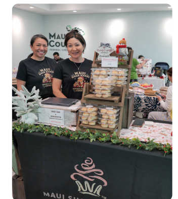
Maui Sugar Mamas featured their ono cookies and manju