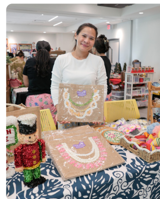
A local bags and accessories company, Maui Leis and Flowers