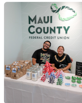
Da Andagi Man Maui with fresh andagi and andagi mixes