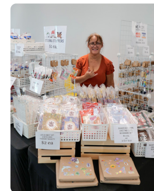
Maui Island Greetings with inland-inspired stationery, greeting cards, and gifts