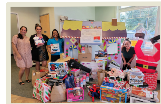
Thank you to everyone who adopted a keiki or kupuna for Christmas and dropped off their gifts at the Lahaina branch.