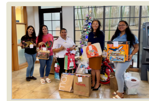
Employees helped The Salvation Army load up Angel Tree gifts that were donated at the Wailuku Branch.