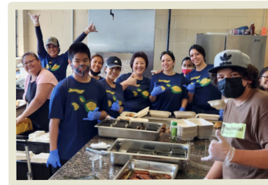
Employees lend their hands at the Binhi At Ani Bayanihan elderly feeding program.