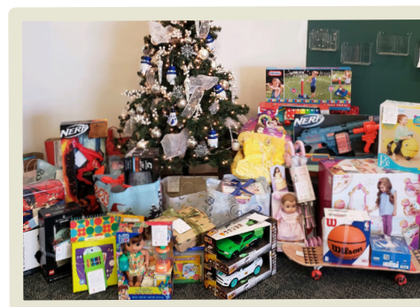
Mahalo to everyone who bought and donated Angel Tree gifts at our Kahului branch at Maui Marketplace.